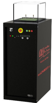
Diode Test Unit