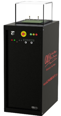
Diode Test Unit